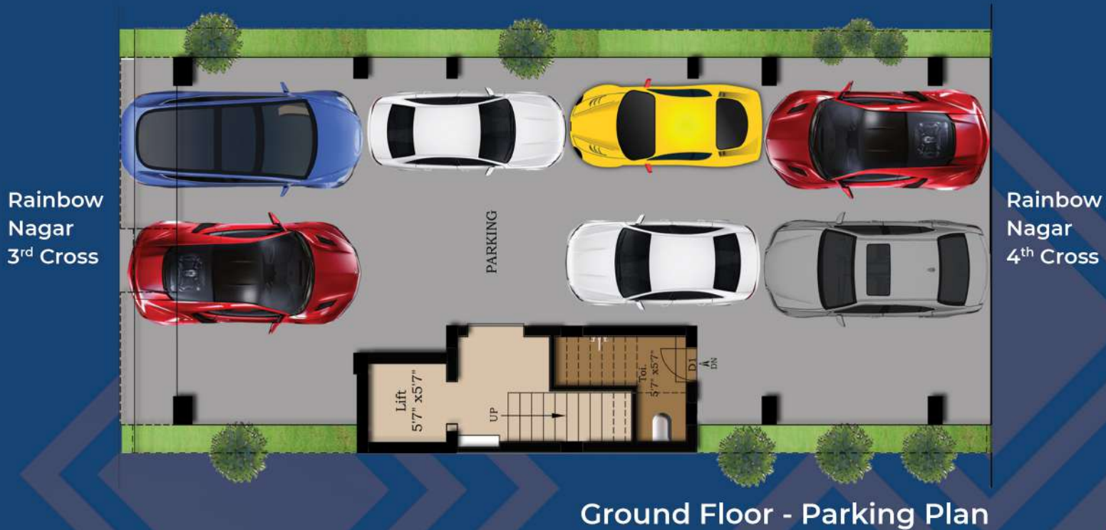
Ground Floor - Parking Plan

Disclaimer: The interior 3D designs, colour schemes, and layouts shown are for illustrative purposes only and may not reflect the final product. Variations in materials, lighting, and dimensions may occur. The designs are subject to modifications based on construction limitations, budget constraints, and client preferences. Colors may differ due to monitor settings, and furniture placement is representational.